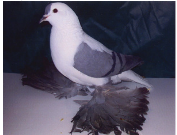
John Taupert's Res.Champion at Edmonton; Blue Black Bar Silesian