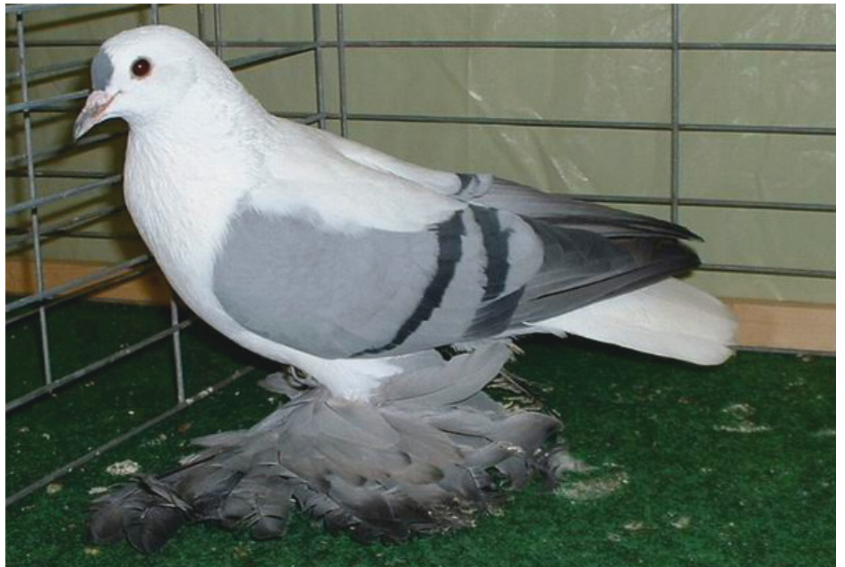
Reserve Champion at the NPA National. Dave Harris; Blue black bar Silesian Swallow.