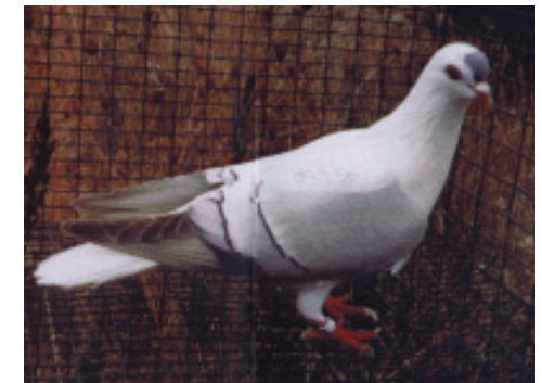
Silver Spangle, Silver White Bar Thuringer Wing Pigeons; Bred and Owned by Dave Holloway