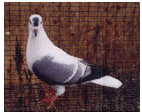
Blue Spangle, Blue White Bar Thuringer Wing Pigeons; Bred and Owned by Dave Holloway